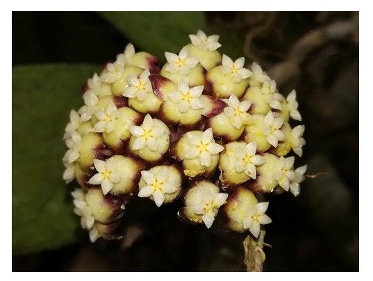
Figure 5. The inflorescence of Hoya finlaysonii at the study sites

parts of Thailand, are well distributed in the northern part of the peninsular, as this region is closer to Thailand (Rodda & Simonsson, 2012; Trân et al., 2011; Wai et al., 2008).