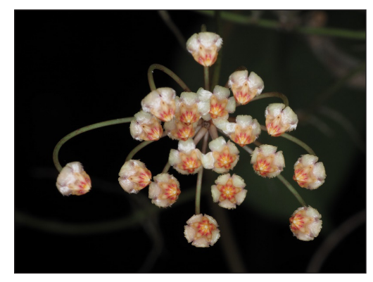
Figure 4 . The inflorescence of Hoya revoluta at the study sites

The major factors that limit the distribution of epiphytes are light, water, and mineral nutrition (Benzing, 2008; Luttge, 2008). The majority of hoyas were found hanging on phorophytes near water stream or river, except a few of them, such as H. erythrina and H. verticillata , which grow on damp boulders and rocks. Although Hoya species mostly occur in areas with high