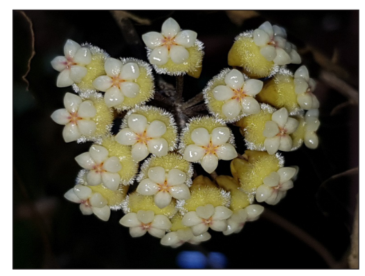
Figure 2 . The inflorescence of Hoya peninsularis at the study sites