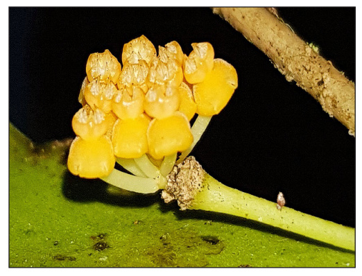
Figure 3 . The inflorescence of Hoya ignorata at the study sites