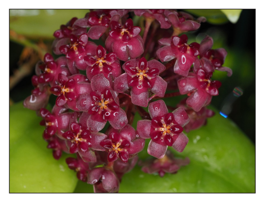
Figure 1. The inflorescence of Hoya sp. cf. scortechinii at the study sites

Note. \sqrt{} means present, x means absent